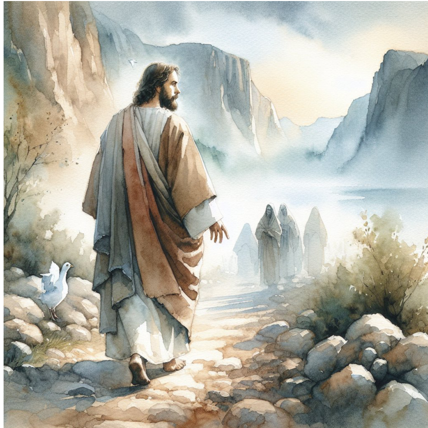
Title and artist unknown